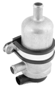
PH with original bracket