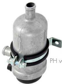
PH with bracket PH Pro

All PH have 20 mm diameter connection tube. The PH can be delivered either as a complete kit with heater and original bracket, cables, etc. or with just a heater and the original bracket. Bracket PH Pro to be ordered separately.